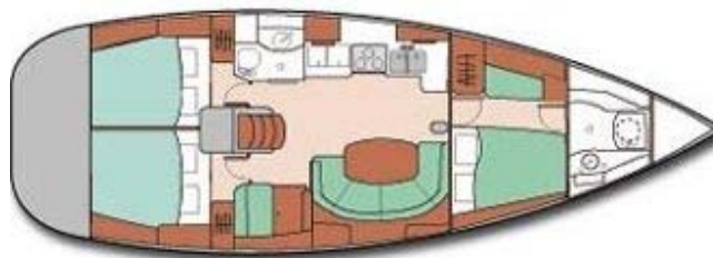
3 Cabin Layout